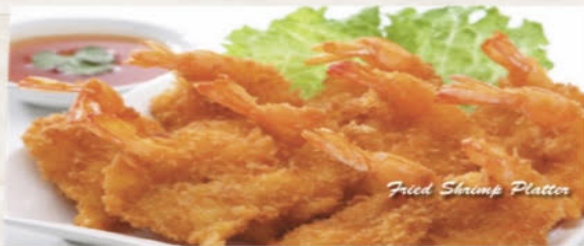
Fried Shrimp Platter