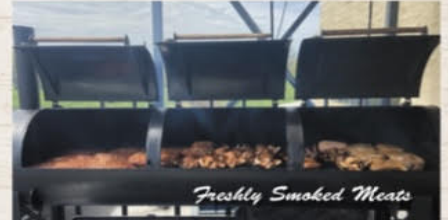
Freshly Smoked Meats

Ask server for daily soups Cup 5.95 | Bowl 8.95