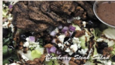
Blueberry Steak Salad

Our Local salad blend topped with steak medallions, blueberries, blue cheese crumbles, candied pecans, red onions, balsamic glaze, and blueberry balsamic. 18.95